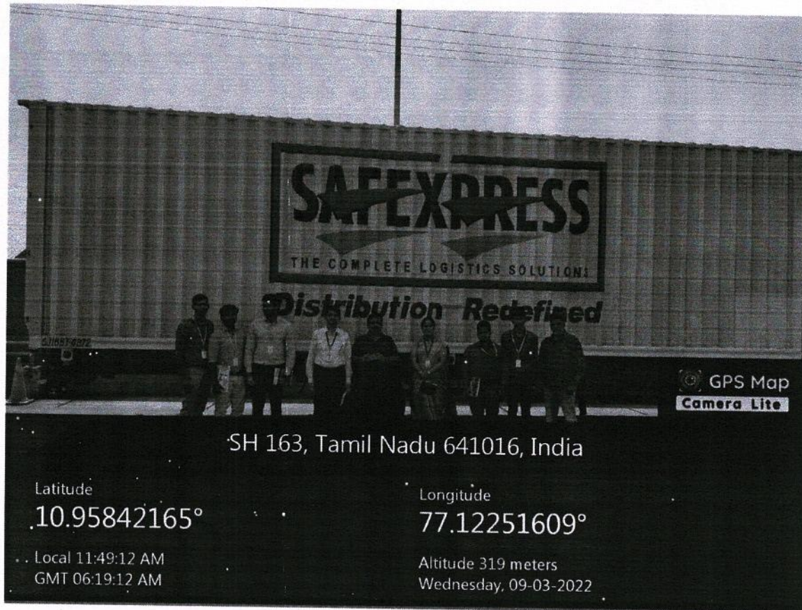
Final MBA students visited Safexpress on 09-03-2022